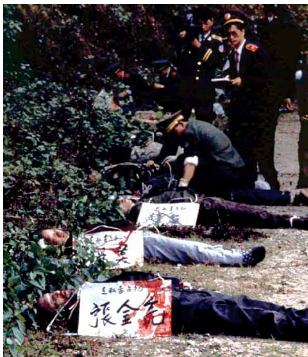
Chinese police inspect the bodies of executed prisoners, 1994.

Shortly after the Ghulja incident, a young Uighur protester’s body returned home from a military hospital. Perhaps the fact that the abdomen was stitched up was just evidence of an autopsy, but it sparked another round of riots. After that, the corpses were wrapped, buried at gunpoint, and Chinese soldiers patrolled the cemeteries (one is not far from the current Urumqi airport). By June, the nurse was pulled into a new case: A young Uighur